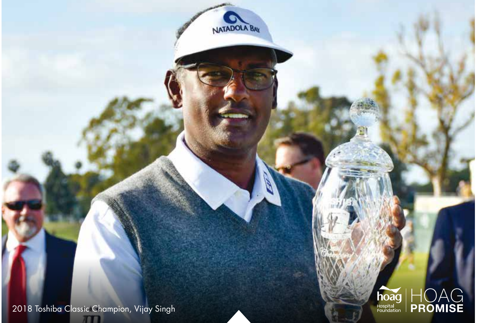
2018 Toshiba Classic Champion, Vijay Singh

2018 Toshiba Classic Thrills Fans While Benefitting Hoag and the Greater Community