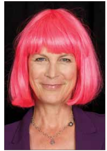
Jamie Lee Curtis – 2014