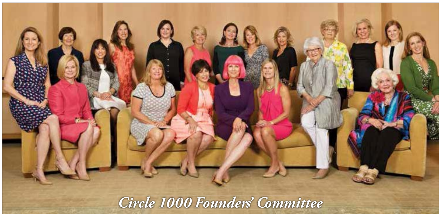
Circle 1000 Founders' Committee