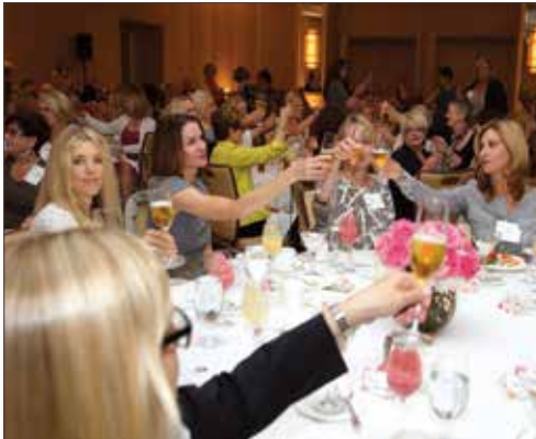
Cancer survivors toasting