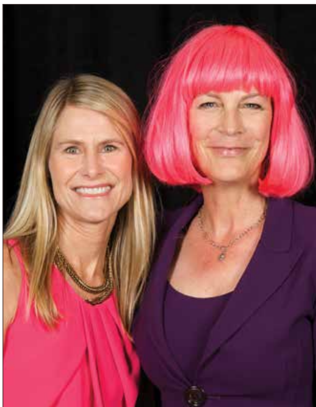
Beth Knapp & Jamie Lee Curtis

You will be pleased to know that, with your help, we raised over $900,000 in 2014. These funds were added to $600,000