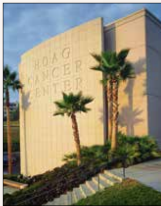
Patty & George Hoag Cancer Center

We are moved and inspired by the magnitude of what we've accomplished together on behalf of cancer patients in our community. You will be pleased to know that funds raised in 2012 were designated to the following areas in Hoag Family Cancer Institute: