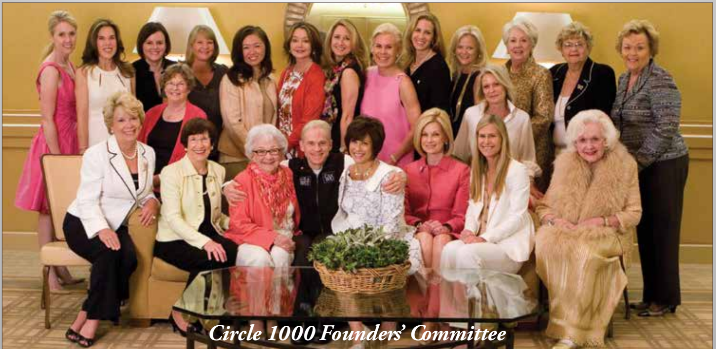
Circle 1000 Founders' Committee