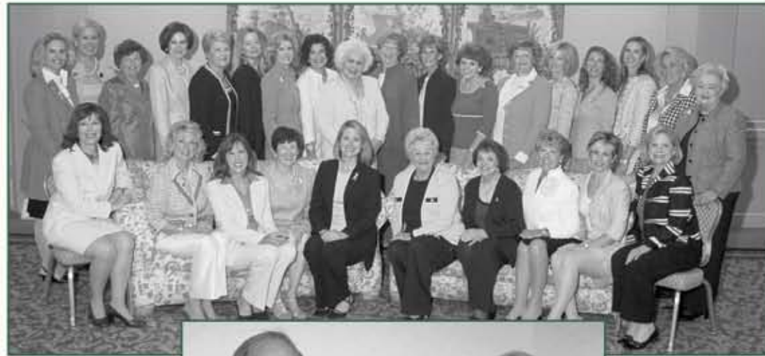
2004 Circle 1000 Committee