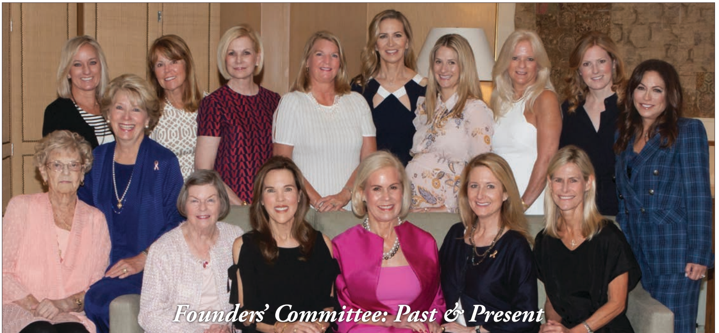
Founders' Committee: Past & Present