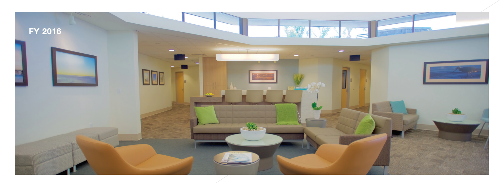
SolMar Recovery, Hoag's World-Class Residential Addiction Rehabilitation Facility