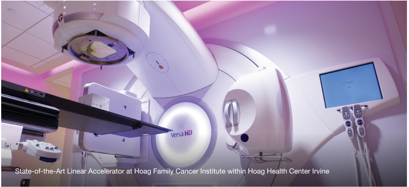
State-of-the-Art Linear Accelerator at Hoag Family Cancer Institute within Hoag Health Center Irvine