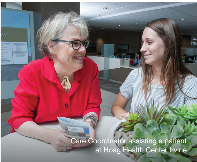
Care Coordinator assisting a patient at Hoag Health Center Irvine

For quality health care to truly be accessible, it must be convenient. The philanthropy-funded, wheelchair-accessible courtesy shuttle transports guests through the entire Hoag Irvine campus, from Hoag Hospital Irvine to Hoag Health Center Irvine and back, and from building to building at Hoag Health Center Irvine. The driver not only transports passengers safely and efficiently, but also ensures patients and family members arrive at their specified destination, giving them greater peace of mind and reducing appointment delays.